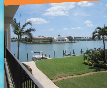
COQUINA CLUB CONDO